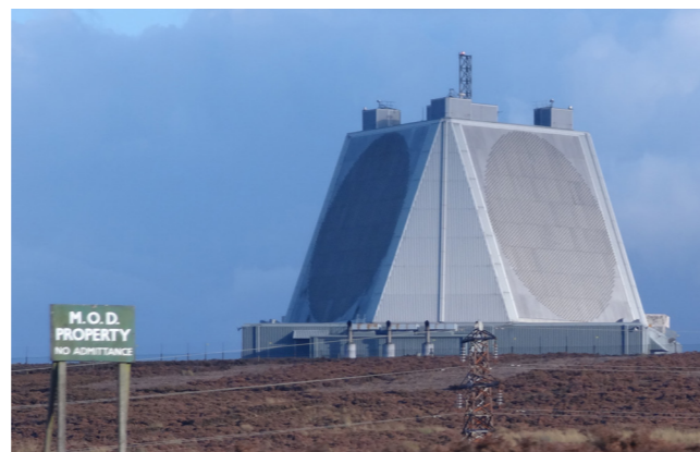
Solid State Phased Array Radar (SSPAR) at Fylingdales, North Yorkshire

So-called RAF Fylingdales is a radar station in the US Solid-State Phased Array Radar System, a US Space Force radar, computer, and communications system for missile warning and space surveillance.