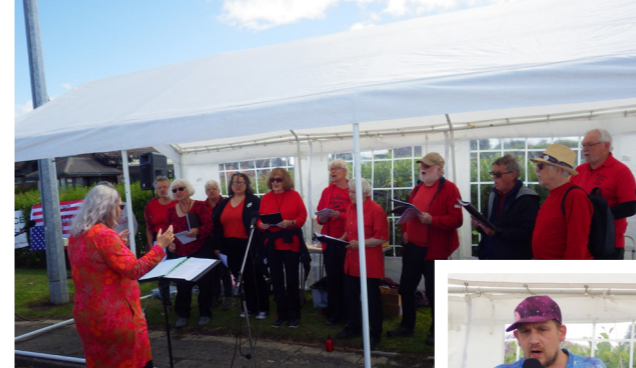
The East Lancs Clarion Choir