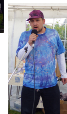
Microphone Jack Performance Poet