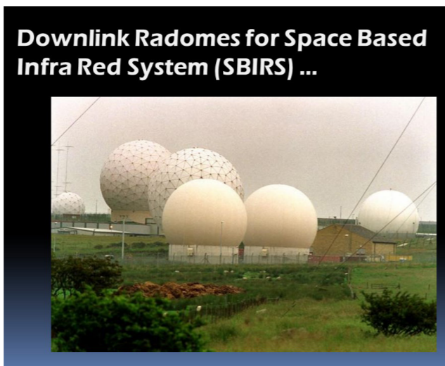
Image of Menwith Hill

Menwith Hill hosts three radomes in the US Space-Based Infrared System, part of US missile defense, 13 under the control of the US Space Force.