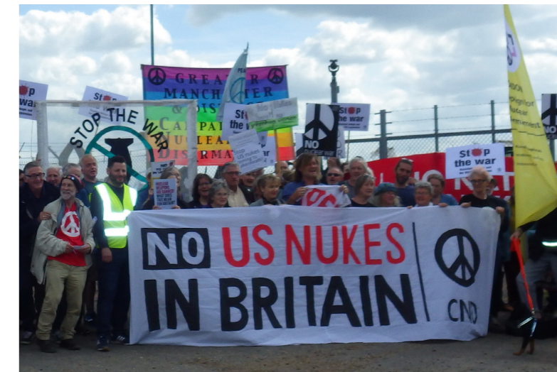
Stop US nukes coming to Lakenheath! Protest organised by CND at Lakenheath on 21 May 2022, attended by supporters of MHAC.

In April 2022 we received the news that US nuclear weapons are possibly to be stored again in the UK, most probably at Lakenheath where nuclear weapons were stored until 2008. 9 US nuclear weapons storage sites in the UK are being upgraded.